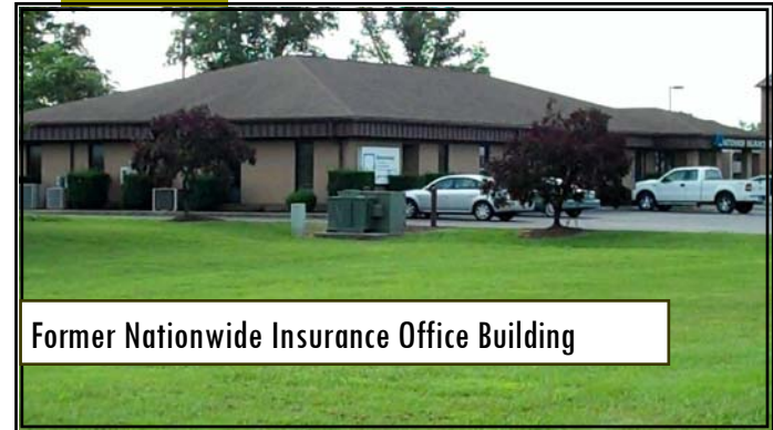
Former Nationwide Insurance Office Building